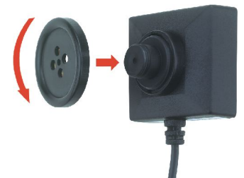
Easily changeable front covert