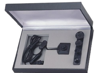
View Inside the Box