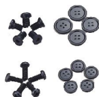
Various Switchable Covert & Spares